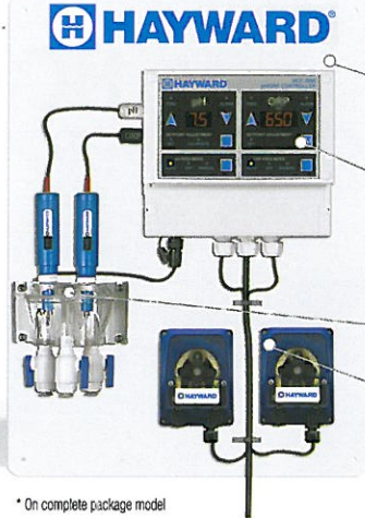
* On complete package model