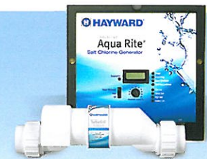
Chlorine dispensing for sanitizer control including electronic chlorine (salt) generator