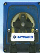
Chemical Feed Pump (2 pumps included as standard with HCC 2000 Complete Package)