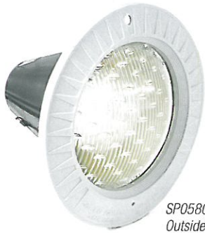
SP058015 Outside diameter of face rim: 10-3/4"