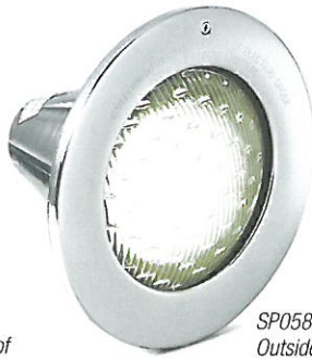
SP0583SL30 Outside diameter of face rim: 10-3/4"