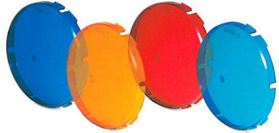
SP0580L Selecta-Color Lens Kit. Now change the mood of your pool at a moment's notice. Simply snap any of the four easy-to-change lens covers over the clear lens of the AstroLite fixture. No fixture removal or assembly is required.